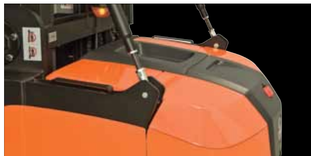
Non-exposed parts, such as the battery cover, are made of plastic to save weight