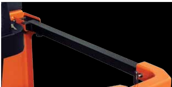
All M-series models feature folding side gates (optional on OME100N and OME100)

A complete auto-test routine is carried out every time each M-series model is activated. This is repeated continuously during operation to ensure safety.