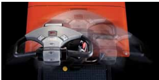
The E-man mini-tiller arm can be offset to either side (option) for easier reversing and walk-with operation

Truck performance is fully programmable to suit the application, with easy access to various parameters via the digital display and controls on the E-man mini tiller arm.