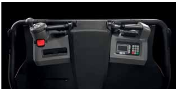
The cabin and controls are designed to make picking to a pallet as easy as possible

Every time the cabin is lowered or the truck decelerates, energy is regenerated back to the battery. Because of this the H-series is able to work for two full shifts on one battery charge in many applications. The battery can be changed quickly thanks to the built-in rollerbed.