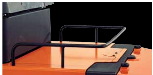
The OME100 and OME100W's parcel rail allows the top of the truck body to be used for temporary storage