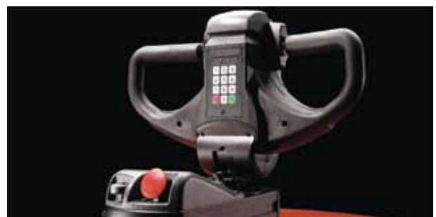
PIN-code activation provides a high level of security as well as allowing the truck's performance characteristics to be optimised for each operator

The BT Powerdrive system allows automatic speed reduction when cornering, to ensure safe operation and confident driving. Automatic speed reduction also applies when driving at the second level ('P' models) or when the truck is pedestrian-operated.