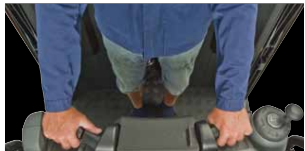
The multiple presence system ensures that the operator is safely in the cab before the truck can move