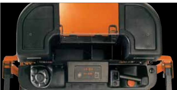
LED indicators and the digital display allow rapid fault diagnosis

The BT Powerdrive system on 'N' models provides reliability and simplicity. CAN-Bus technology means fewer parts and reliable motor and system control. Routine and emergency maintenance is straightforward, with easy access to all components.