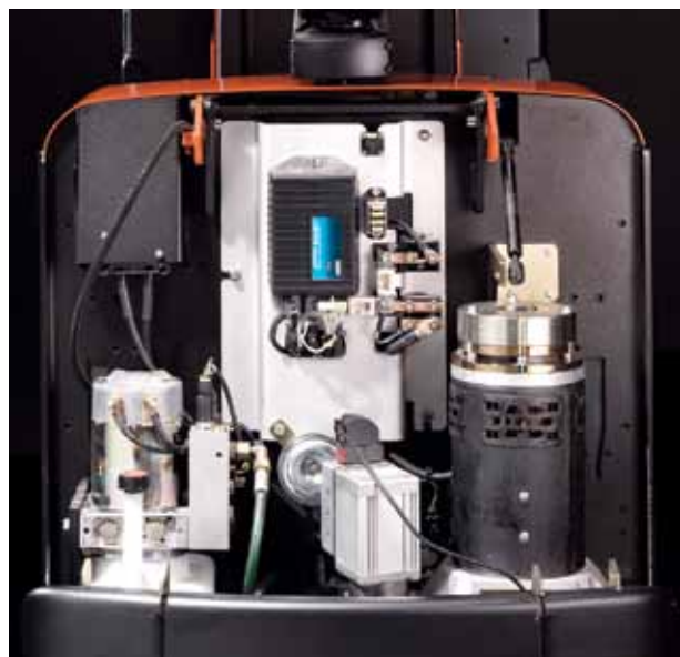
L-series models have excellent service access, helping to keep your operation running