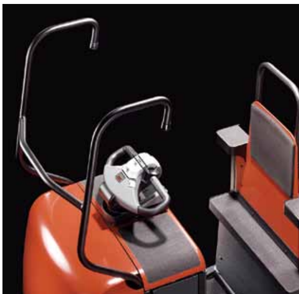
An optional step-up kit aids occasional second-level picking on OSE120, OSE250, and OSE200X models

For added safety and ease-of-use, the drive-wheel will always revert to the straight-ahead position when E-man is released. Furthermore, the electrical servo absorbs any shocks to the drive-wheel to protect the driver. When the truck is operated by a pedestrian the steering radius is automatically limited.