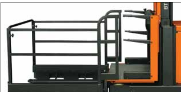
M-series 'W' models have a 'walk-through' design for picking bulky articles

All BT Optio M-series trucks offer an optional E-bar, which allows the mounting (with power supply) of ancillary equipment such as PCs and barcode readers.