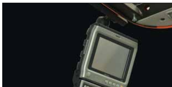
The unique E-bar can be specified in a number of locations for mounting and powering devices such as computers and barcode scanners