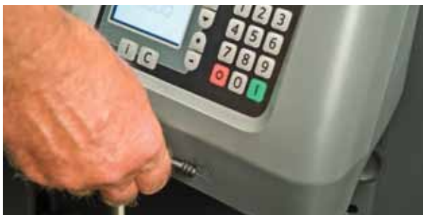
BT Optio H-series requires either a PIN-code or an ID key (option) to start

Efficient LED arrays provide in-cab lighting and there are several places to store items. A writing pad is integrated in the auxiliary lift cover. A cooling fan and radio/CD unit can also be specified.