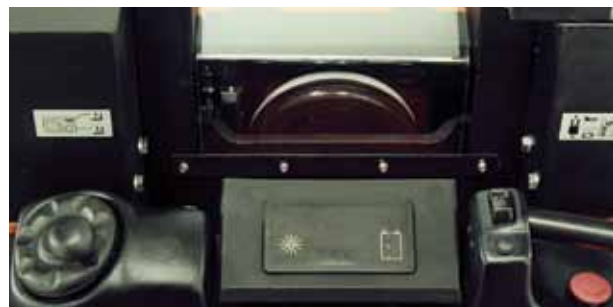
The comprehensive display shows lift height, battery status and drive-wheel position as well as warning and error codes