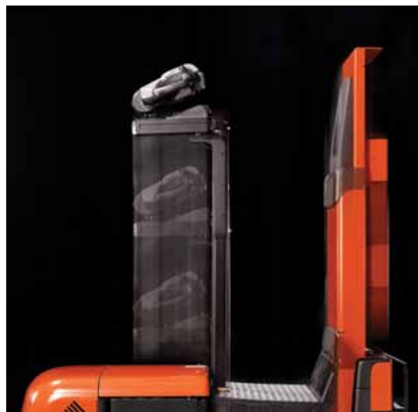
BT Optio L-series models with elevating platforms also have elevating controls, allowing manoeuvring and driving without having to lower the platform

Being able to control the truck in the elevated position has a number of benefits. For example, the precise position of the truck can be 'fine-tuned' after the operator has raised the platform, to enable easier picking. The truck can also be driven whilst the platform is being lowered or raised. The platform can be lowered using a foot-operated switch on the platform floor, which is invaluable if the operator – as is likely – is holding an item while lowering the platform.