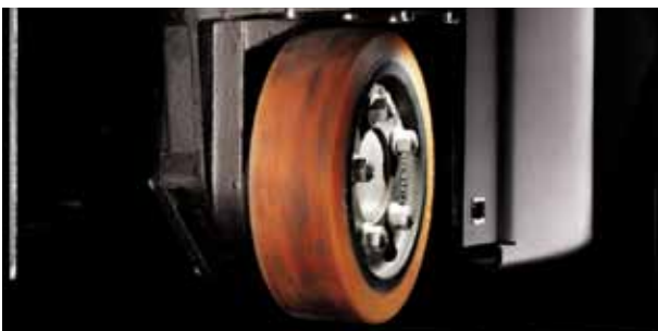
The drive-wheel on BT Optio L-series models sustains significantly less wear thanks to the trucks' electronically controlled acceleration and braking

One of the major wearing parts on most low-level order pickers is the drive-wheel, due to the stress of repeated starting and stopping. The smooth, controlled operation of the electronic braking system on BT Optio L-series trucks significantly reduces drive-wheel wear.