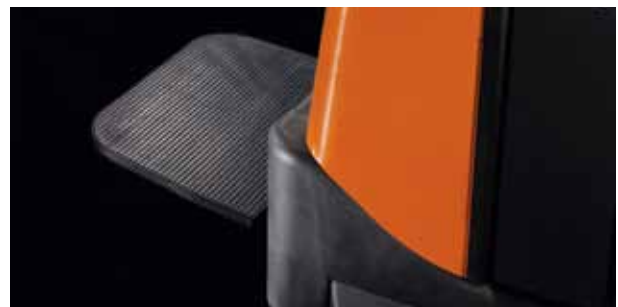
BT Staxio P-series models can be specified with or without rider platforms