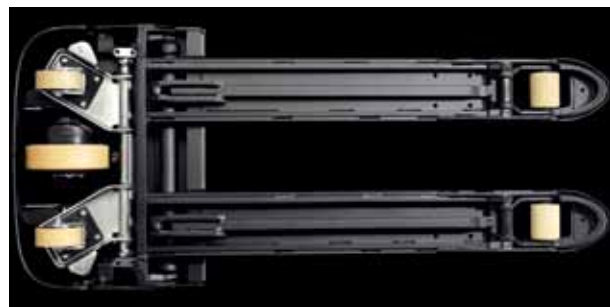
BT's unique 5-wheel chassis improves stability on ramps