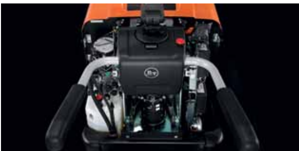
BT Powerdrive reduces components to a minimum

Part of the BT Staxio P-series range, the RWE120 is a pedestrian reach truck with moving mast. It also has adjustable width forks, for mixed or bottom-boarded pallet handling. Its maximum lift height is 4.8 m and load capacity 1200 kg.