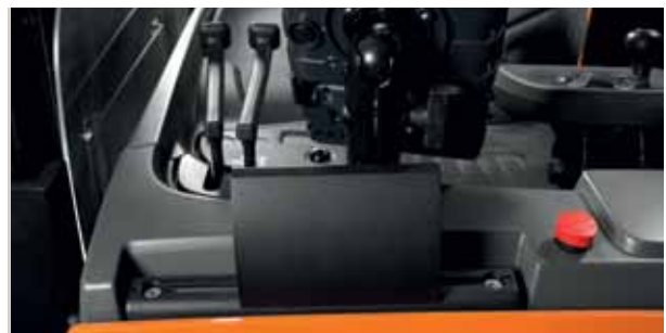
The E-bar universal mount for warehouse management devices such as PCs, terminals, bar code readers