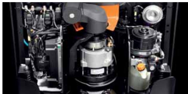
The fixed motor has no moving cables