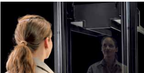
The BT Totalview design concept ensures the fork tips are visible from the operating position

All BT Staxio models come with useful storage compartments on top of the truck body. An optional 'E-bar' allows mounting of a writing table and shrinkwrap holder, as well as powered ancillary equipment such as PCs, radio-data terminals and barcode scanners.