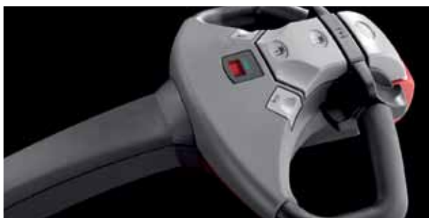
The tiller arm's control handle incorporates BT Powerdrive technology, for easy, intuitive control

All models are available with the E-bar mounting rail for ancillary equipment such as writing tables and shrinkwrap holders. It can also incorporate a power supply for items such as PCs, radio-data terminals and barcode scanners.