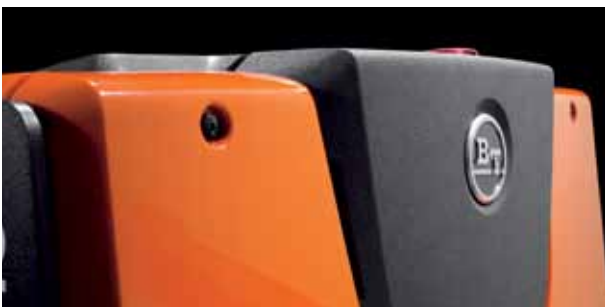
The hood is secured by two bolts for fast access

leak-free hydraulic connectors and CAN-Bus wiring all add up to maximum reliability. W-series models are designed to be serviced only once a year in typical single-shift operations.