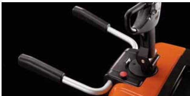
Folding sideguards offer protection to the operator without compromising the manoeuvrability advantages of the flip-down platform

A large emergency button is located at the tip of the handle. This ensures that the truck's direction will be reversed immediately if the handle encounters an obstacle, preventing the truck from crushing the operator. To further ensure operator safety, all models feature skirting that offers full protection to the feet.