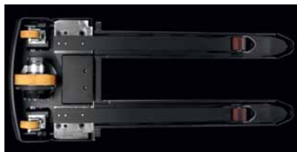
The HWE100 has BT's unique 5-wheel chassis for excellent stability and control