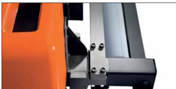
The HWE100S offers the same features as the HWE100 but also has straddle arms for handling different pallet sizes. Both models have a maximum lift height of two metres

The HWE100 features the unique BT Castorlink system with castor wheels that rotate within the truck's body profile. This provides smooth and easy operation on ramps and reduces the risk of wheel damage.