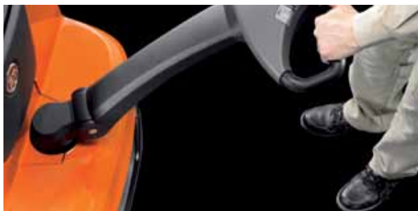
BT Staxio W-series' profile allows manoeuvrability in the tightest conditions

W-series chassis skirt is just 35 mm from the ground and rounds away from the operator's feet, providing the perfect balance of foot protection without compromising the truck's manoeuvrability on ramps and other slopes. When working on gradients the truck is designed to ensure no risk of rolling back when starting or stopping.