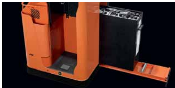
The battery on S-series models is seated on rollers with a built in battery table, allowing easy sideways battery exchange