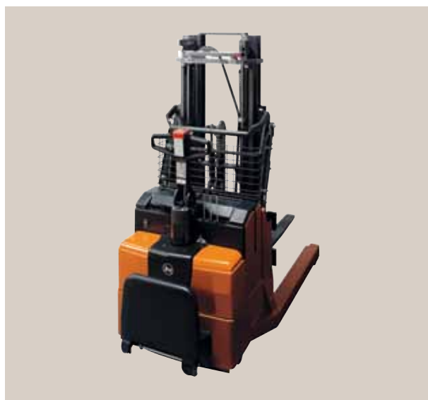
The RWE120 is a pedestrian-operated reach truck with a lift height of 4.8 m