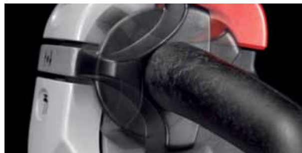
The Click-2-Creep function allows the truck to be manoeuvred with the handle upright