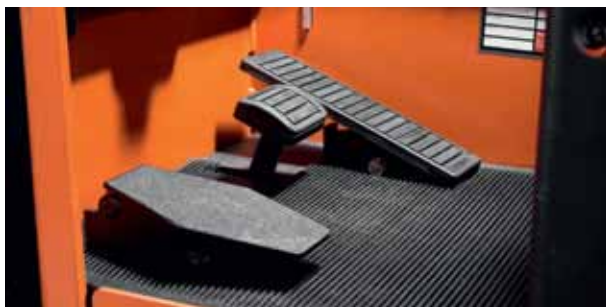
Pedal layout is as in a car, optimising safety and productivity

The SRE135L and SRE160L models feature elevating support arms that allow effective operation on ramps or over uneven surfaces. These also allows double pallet handling, with 675 kg + 675 kg (SRE135L) and 800 kg + 800 kg (SRE160L).