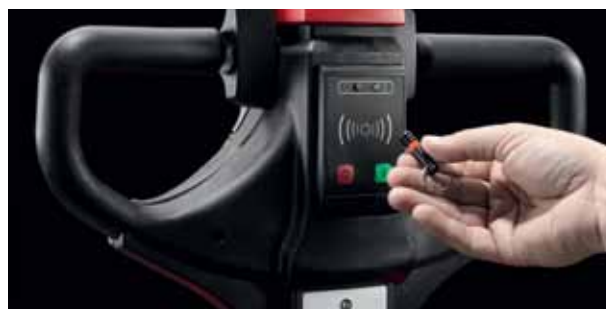
'Smart access' with a remote key or card ensures the truck starts-up with the appropriate performance settings for each operator