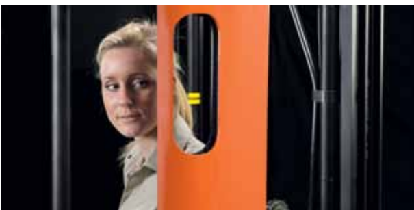
The visibility window adds to the S-series' high safety standards

With the forks lowered the support arm lift has a maximum capacity of 1600 kg for horizontal travel and 1200 kg for stacking.