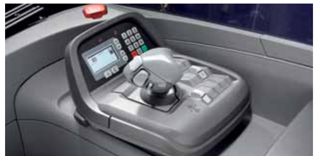
An optional multifunction control unit can be selected, depending on the preference and experience of your drivers