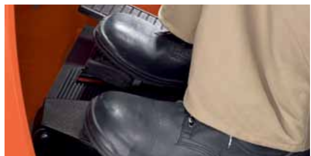
Electronic braking adds to the N-series' driveability