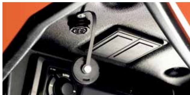
The latest 'CAN' technology also keeps parts to a minimum