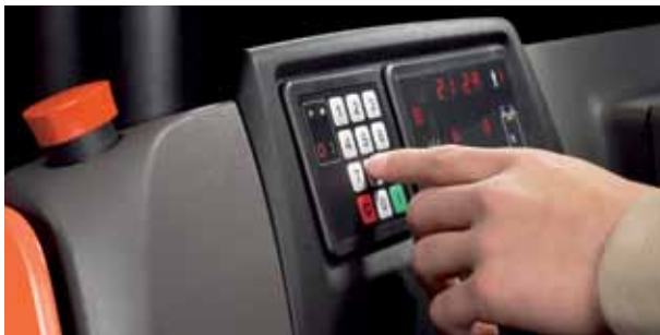
Unique to BT, Reflex M offers PIN-code entry as standard to ensure that the truck is only used by authorised personnel

Pedals are laid out as in a car for maximum ease-of-use, and safety in emergencies. The left foot 'dead-man' pedal sounds a beeper when released, and may be programmed to apply auto-braking. This safety feature directly reduces the risk of left foot injury.