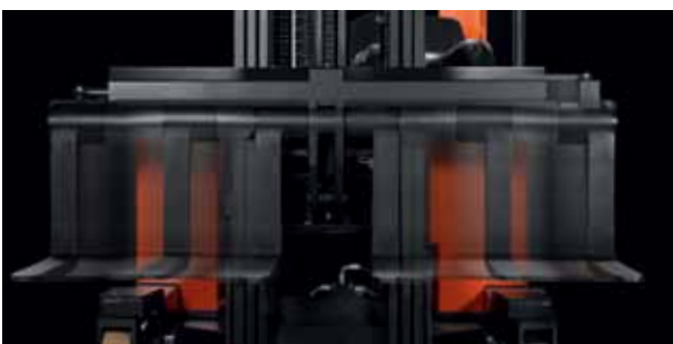
The BT Reflex F-series can spread its forks over a range of 0.54 m to 2.22 m

Maximum lift height is 8 m, load capacity 2700 kg.