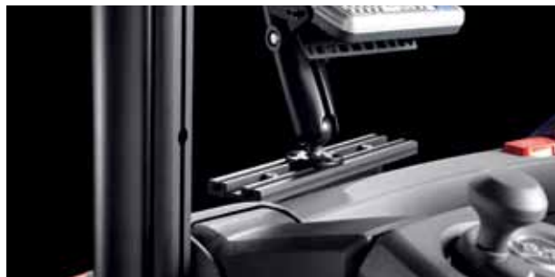
The optional E-bar is designed to carry ancillary equipment, offering standard interfaces and a built-in power supply