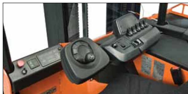
The cabin is spacious and comfortable, and the controls offer fingertip operation, for precise and effort-free load handling