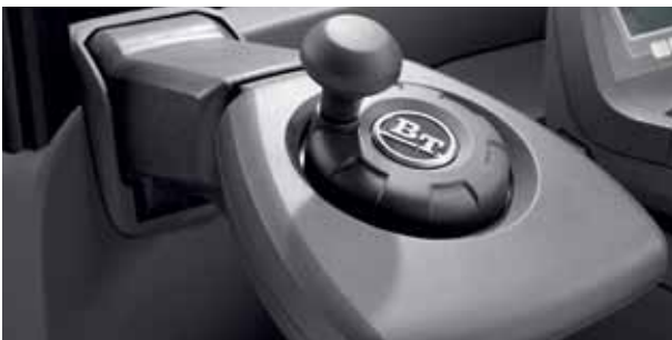
The advanced 360° steering system on all BT Reflex trucks allows exceptional manoeuvrability

BT Reflex trucks are powered by AC motors, which ensure maximum energy efficiency. Consumption rates are low on all BT Reflex models, with the added benefit of energy being recycled on deceleration and braking. For multi-shift operations these trucks can interface with battery change systems and the battery can be quickly and easily power-released while the driver is seated in the cab.