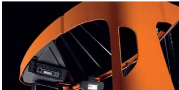
BT carefully considered all aspects of visibility during the design process

The driver console is low and slopes away from the driver. This gives maximum forward visibility from the cab when manoeuvring in congested areas.