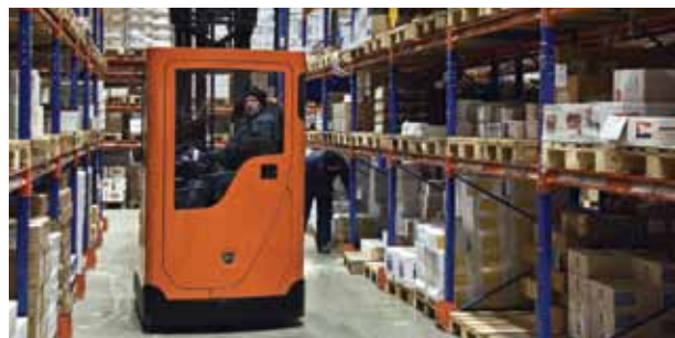
All BT Reflex models can be specified for cold store use