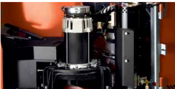
The absence of carbon brushes and power contacts in its AC drive motor reduces maintenance downtime