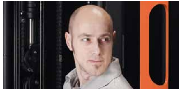
The design of the cab not only provides panoramic vision for the operator, but also provides excellent protection – the operator is fully contained within the profile of the cab