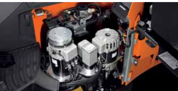
BT Reflex R-series has durability designed-in with its sealed electrical units, brushless motors and leak-free connectors

Routine servicing and safety checks are of course essential. It is also important to keep time lost to servicing to the absolute minimum. The latest generation of BT Reflex reach trucks has extended service intervals due to the use of long-life or maintenance-free components. On-board diagnostics can quickly pinpoint any faults as they occur and ensure that remedial action is fast and effective. This is further supported by exceptionally easy service access to all areas of the truck.