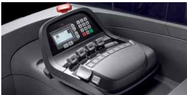
Standard mini-levers allow fingertip control of each fork movement

This option allows frequently accessed lift heights to be pre-programmed for fast and accurate stacking. The pre-selection system differentiates between placement and retrieval cycles, accurately controlling fork movements throughout the process. Information is displayed on the load information display, which also shows lift height and load weight.