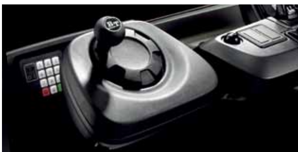
BT Reflex N-series' electronic, progressive 360° steering is perhaps the most significant contribution to the driving experience

'E' stands for efficiency and effective integration with warehouse management systems. The E-bar is a universal mount for warehouse management devices such as on-board computers, radio data terminals, and barcode readers. It can be equipped with an integral 12 V or 24 V DC power supply, ensuring that Reflex M is ready to fit into any application.