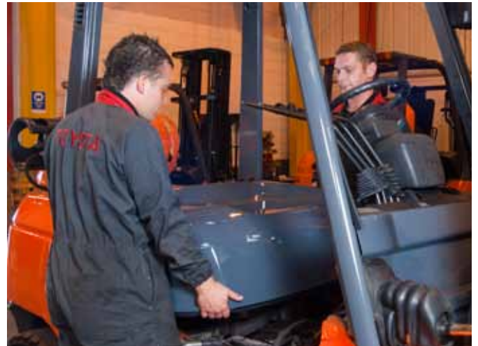
TMHUK MHP 1109 Images are for illustration only. Actual trucks will vary